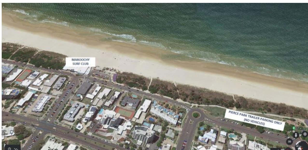
Pierce Park, Maroochydore

Gear Trailer Parking access is available at Pierce Park, Alexandra Parade, Maroochydore from 5pm Thursday 22 nd January. Further descriptions on this can be seen in the site map below. All club, competitors and officials are to read and obey the parking signs set up by the Sunshine Coast Council and the Carnival Committee. Gear trailer access is located as per the following site map: