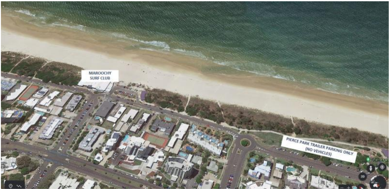
Pierce Park, Maroochydhore